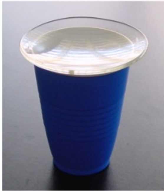
Figure 4. Sample Presentation to Panelists

panelist was presented with three cups at a time. One of the cups contained the spiked sample and the other two cups contained blank water. The panelists were asked to pick up each cup and watch glass, gently swirl the water in the cup, lift the watch glass and sniff the headspace above the water replacing the watch glass when they were finished. The panelists were instructed to then choose the odor in the cup that was different from the other two.