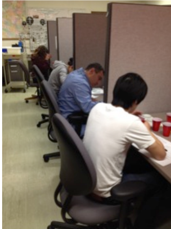
Figure 2. Taste and Odor Testing Room at UCLA

The H&S panel was held in a business office setting where cups of water for testing were delivered to the panelists at their desks. There were no fugitive odors in the office that interfered with odor detection. The UCLA panel was held in a special odor panel room in the School of Public Health maintained by Dr. I. H. Suffet. Each UCLA panelist conducted his/her assessment of the samples in specially constructed booths that ensured privacy and independent determination—see Figure 2.