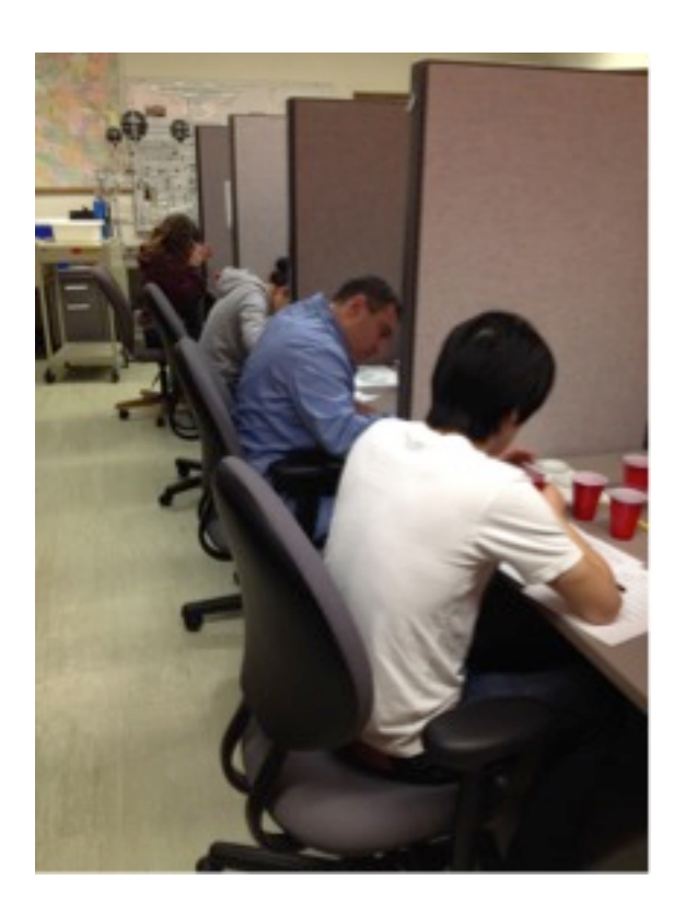
Figure 2. Taste and Odor Testing Room at UCLA

The H&S panel was held in a business office setting where cups of water for testing were delivered to the panelists at their desks. There were no fugitive odors in the office that interfered with odor detection. The UCLA panel was held in a special odor panel room in the School of Public Health maintained by Dr. I. H. Suffet. Each UCLA panelist conducted his/her assessment of the samples in specially constructed booths that ensured privacy and independent determination—see Figure 2.