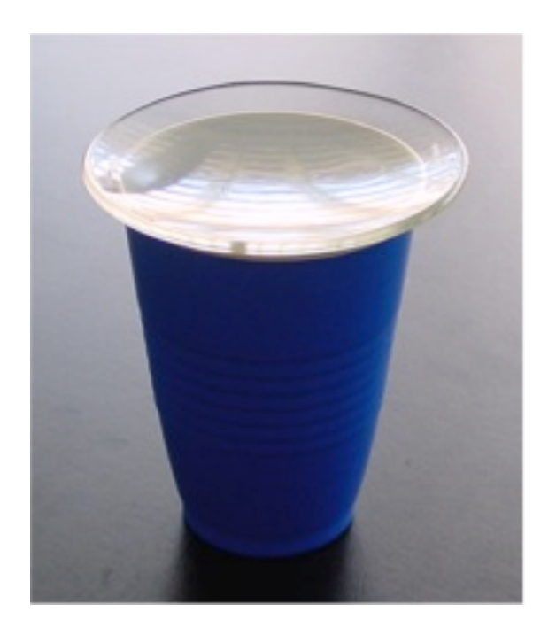
Figure 4. Sample Presentation to Panelists

panelist was presented with three cups at a time. One of the cups contained the spiked sample and the other two cups contained blank water. The panelists were asked to pick up each cup and watch glass, gently swirl the water in the cup, lift the watch glass and sniff the headspace above the water replacing the watch glass when they were finished. The panelists were instructed to then choose the odor in the cup that was different from the other two.